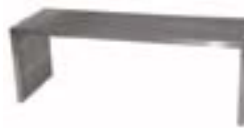
OT839 LINEAR COCKTAIL TABLE Steel 46"Wx15"Dx16"H