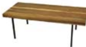
OT804 TUSCAN COCKTAIL TABLE Teak 48"Wx21"Dx16"H