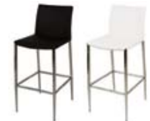
ST216 BELLA STOOL Black, White 17"Wx19"Dx30"H