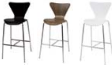
ST214 TENDY STOOL Black, Walnut, White 17"Wx17"Dx30"H