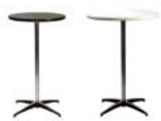
BT400 / BT401 BAR PEDESTAL TABLE Black, White 24"Dia.x42"H or 30"Dia.x42"H