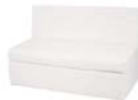
LG732 SOHO LOVESEAT White 48"Wx24"Dx31"H