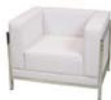
LG742 MAUI ARM CHAIR White 35"Wx29"Dx27"H