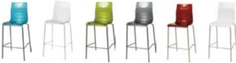
ST209 LIQUID STOOL Blue, Clear, Green, Grey, Red, White 19"Wx20"Dx30"H