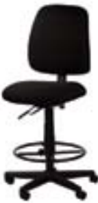
CO513 TASK STOOL Black, Adjustable 19"Wx22"Dx23-27"H