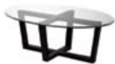
OT801 MONZA COCKTAIL TABLE Black 50"Wx32"Dx18"H