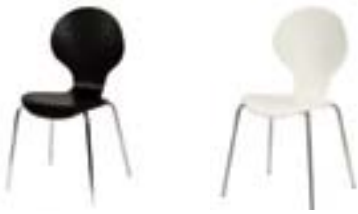
CH100 JACOBSON CHAIR Black, White 18"Wx17"Dx18"H