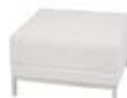
LG745 MAUI OTTOMAN White 28"Wx28"Dx17"H