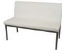
LG749 TICINO SETTEE White 48"Wx24"Dx34"H