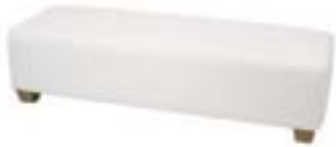
LG750 BENCH OTTOMAN Black, White 60"Wx20"Dx17"H