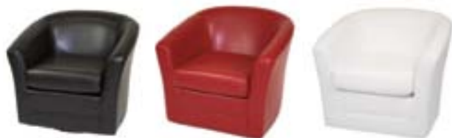
LG780 STEN SWIVEL CHAIR Black, Red, White 32"Wx32"Dx29"H