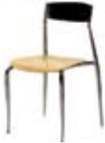
CH104 TOLEDO CHAIR Natural/Chrome 17"Wx19"Dx18"H