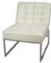
LG747 ANTON CHAIR Pearl 26"Wx33"Dx32"H