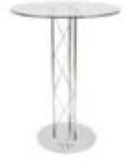
BT406 TRAVE BAR TABLE Chrome/Glass 32"Dia.x42"H (Other sizes available)