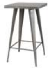
BT412 RETRO BAR TABLE Steel 24"Sq.x42"H