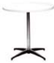
CT301 PEDESTAL TABLE Black, White 30"Dia.x30"H