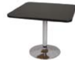
CT305 SQUARE CAFE TABLE Black, White 36"Sq.x30"H