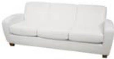
LG706 SCANDIC SOFA Black, Red, White 82"Wx34"Dx30"H