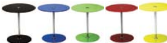
OT821 VEGA TABLE 18" DIA. Black, Blue, Green, Red, White, Yellow - Adjustable 18"Dia.x19-31"H