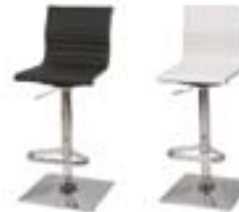
ST210 OTTO STOOL Black, White 16"Wx18"Dx24-30"H