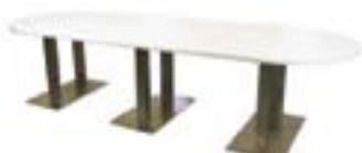
CF610 OVAL CONFERENCE TABLE Black, White 120"Wx42"Dx30"H