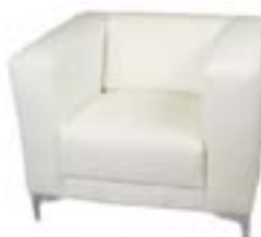
LG737 ASPEN CHAIR White 36"Wx31"Dx28"H