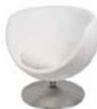
LG785 LARGO CHAIR White 30"Wx26"Dx28"H