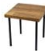
OT805 TUSCAN END TABLE Teak 18"Wx18"Dx18"H