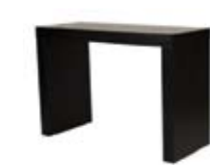
BT454 BALI BAR Black, White 56"Wx24"Dx40"H