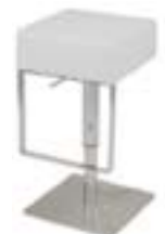
ST219 TECH STOOL White - Adjustable 15"Wx15"Dx22-29"H