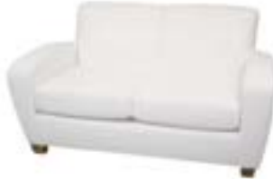
LG707 SCANDIC LOVESEAT Black, Red, White 59"Wx34"Dx30"H