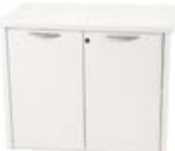
OF653 STORAGE CABINET Black, White - Locking 37"Wx20"Dx29"H