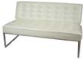
LG746 ANTON LOVESEAT Pearl 58"Wx33"Dx32"H