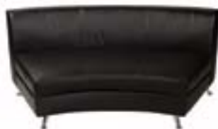
LG720 CAPRI SECTIONAL SOFA Black, White 71"Wx35"Dx30"H