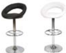
ST217 PLUTO STOOL Black, White 22"Wx18"Dx24-32"H