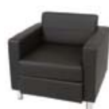
LG716 MALIBU CHAIR WITH POWER Black, White 32"Wx31"Dx29"H