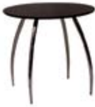
CT307 BISTRO TABLE Black, Natural, White 30"Dia.x30"H