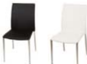
CH116 BELLA CHAIR Black, White 18"Wx20"Dx19"H