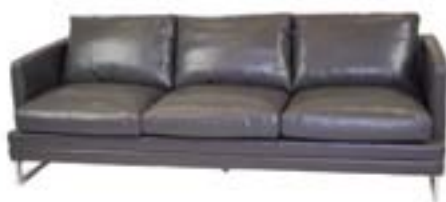
LG733 TRIBECA LEATHER SOFA Grey 89"Wx36"Dx33"H