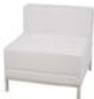
LG743 MAUI ARMLESS White 28"Wx28"Dx27"H