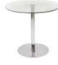
CT313 MARTINI TABLE Chrome/Glass 36"Dia.x30"H