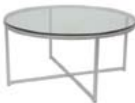
OT843 SPA COCKTAIL TABLE Silver/Glass 36"Dia.x18"H