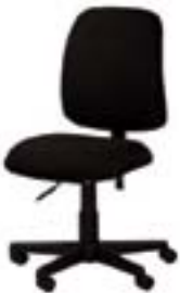
CO512 TASK CHAIR Black 19"Wx22"x18-22"H