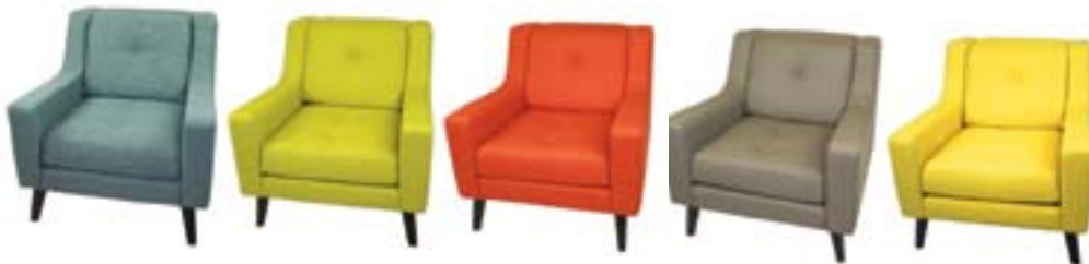
LG723 DANE CHAIR Blue, Green, Orange, Taupe, Yellow 34"Wx41"Dx34"H