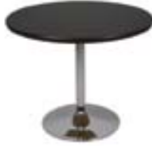
CT302 CAFE TABLE Black, Grey, White 36"Dia.x30"H