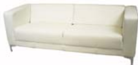
LG736 ASPEN SOFA White 82"Wx31"Dx28"H