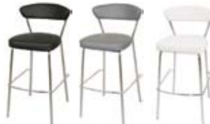
ST218-2 EURO 2 STOOL Black, Grey, White 20"Wx17"Dx33"H