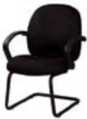
CO507 GUEST CHAIR Black 25"Wx25"Dx18"H