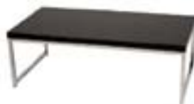
OT841 GIO COCKTAIL TABLE Black, Espresso 44"Wx22"Dx15"H