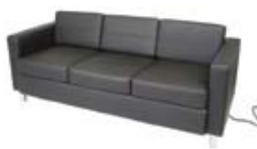
LG715 MALIBU SOFA WITH POWER Black, White 73"Wx31"Dx30"H