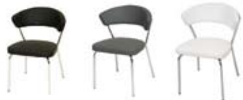
CH118 EURO CHAIR Black, Grey, White 22"Wx21"Dx18"H