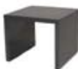
OT829 ABBY END TABLE Grey, White 24"Wx24"Dx20"H