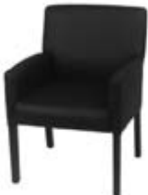
CO518 RECEPTION CHAIR Black 24"Wx26"Dx36"H