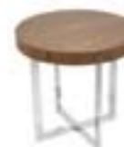
OT815 PALMA END TABLE Walnut, White 22 Dia.x22"H