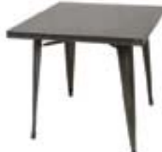
CT312 RETRO TABLE Steel 32"Wx32"Dx30"H