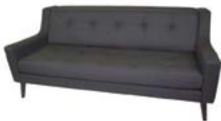
LG722 DANE SOFA Grey 80"Wx41"Dx34"H