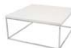
OT855 KLUB COCKTAIL TBL. White 36"Wx36"Dx15"H