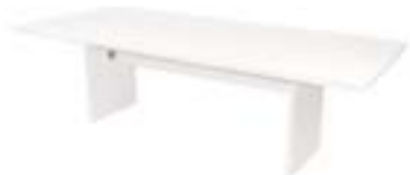
CF609 RECTANGULAR CONFERENCE TABLE Black, White 96"Wx42"Dx30"H