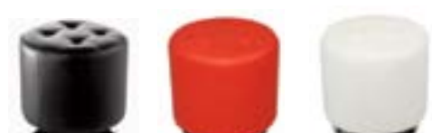
LG753 ROUND SWIVEL OTTOMAN Black, Orange, White 18" Dia.x17"H