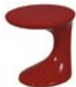
OT822 SPLIT SIDE TABLE Black, Red, White 15"Wx18"Dx18"H