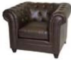
LG702 HAVANA CHAIR Brown 43"Wx38"Dx34"H