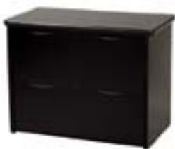
OF652 LATERAL FILE Black - Locking 36"Wx24"Dx29"H