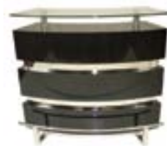
BT453 MILANO BAR Black, White 48"Wx20"Dx42"H