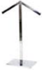
XT909 WATERFALL STAND Chrome - Adjustable 48"-72"H