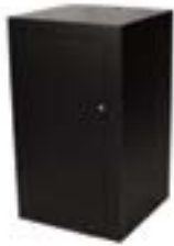
XT916 COMPUTER PEDESTAL Black, White - Locking 24"Wx24"Dx42"H