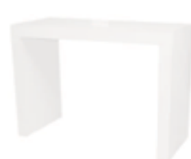
BT454-P W/POWER Black, White 56"Wx24"Dx40"H