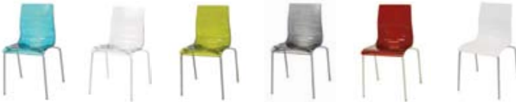
CH109 LIQUID CHAIR Blue, Clear, Green, Grey, Red, White 20"Wx18"Dx18"H