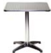
CT310 CHROMA TABLE Aluminum 27sq.x30"H