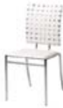
CH106 CRISS CROSS White/Chrome 17"Wx19"Dx18"H