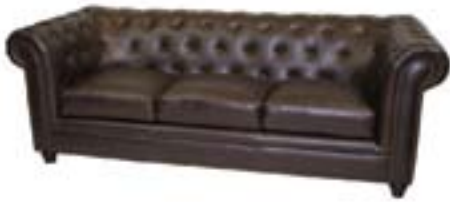
LG700 HAVANA SOFA Brown 93"Wx38"Dx34"H