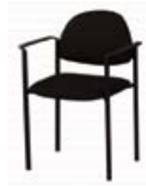
CO510 STACKABLE ARM CHAIR Black 24"Wx20"Dx18"H