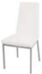
CH111 TICINO CHAIR White 18"Wx19"Dx18"H