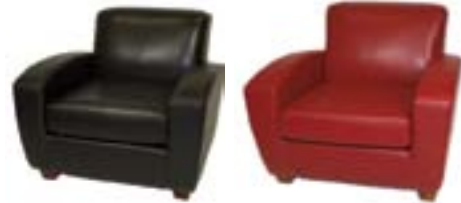
LG708 SCANDIC CHAIR Black, Red, White 38"Wx34"Dx30"H