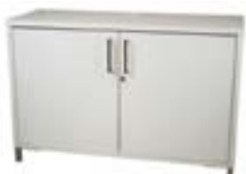
OF659 STORAGE CREDENZA White 48"Wx18"Dx33"H