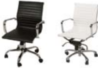
CO502 OTTO CHAIR Black, White 22"Wx24"Dx18-21"H