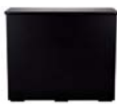
BT451 INFORMATION COUNTER Black, White - Locking 48"Wx20"Dx40"H