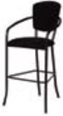
ST202 MONACO STOOL Black 23"Wx23"Dx30"H