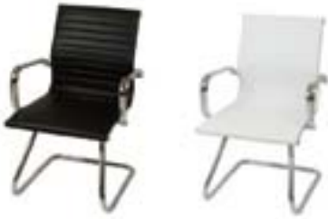
CO501 OTTO GUEST CHAIR Black, White 22"Wx24"Dx18"H