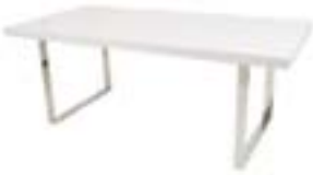
CF604 GLACIER CONFERENCE TABLE White-Gloss 79"Wx40"Dx30"H