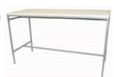
BT457-P W/POWER Black, White 72"Wx30"Dx42"H