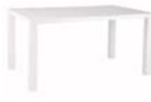
CT355 ABBY TABLE White 63"Wx36"Dx30"H