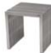
OT840 LINEAR END TABLE Steel 15"Wx15"Dx16"H