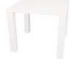
CT314 ABBY CAFE TABLE White 36"Wx36"Dx30"H