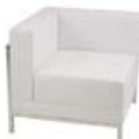
LG744-L MAUI CORNER White 28"Wx28"Dx27"H