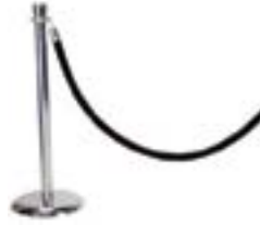
XT905 CHROME STANCHION/ XT906 ROPE Black, Red 12"Wx39"H rope 6'