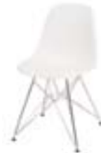
CH107 PARIS CHAIR White/Chrome 19"Wx22"Dx18"H