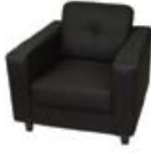
LG714 SOLO CHAIR Black, Red 34"Wx35"Dx32"H