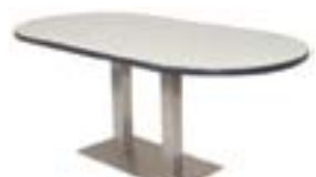
CF606 / CF608 CONFERENCE TABLE Black, Grey, White 72"Wx36"Dx30"H or 96"Wx42"Dx30"H