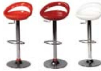
ST208 TICKLE STOOL Orange, Red, White - Adj. 19"Wx21"Dx23-31"H