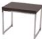
OT842 GIO END TABLE Black, Espresso 22"Wx16"Dx18"H