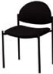
CO509 STACKABLE SIDE CHAIR Black 20"Wx20"Dx18"H