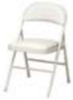
XT199 FOLDING CHAIR Black, Grey 19"Wx20"Dx18"H