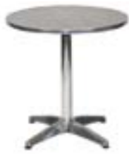
CT311 CHROMA TABLE Aluminum 27"Dia.x30"H