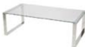
OT817 KEMI COCKTAIL TABLE Chrome/Glass 48"Wx24"Dx16"H