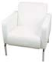
LG709 PRATO ARM CHAIR Black, White 29"Wx28"Dx33"H