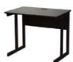
OF654 COMPUTER WORKSTATION Black 36"Wx24"Dx29"H