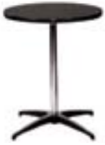
CT300 PEDESTAL TABLE Black, White 24"Dia.x30"H