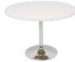
CT303 CAFE TABLE Black, Grey, White 42"Dia.x30"H