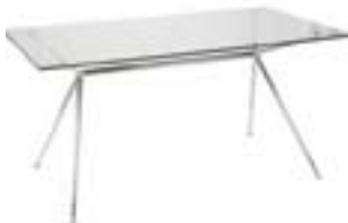
CT353 ALTOS TABLE Chrome/Glass 60"Wx36"Dx30"H