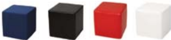
LG755 BLOCK OTTOMAN Blue Microfiber, Black, Red, White Leatherette 18"Wx18"Dx18"H