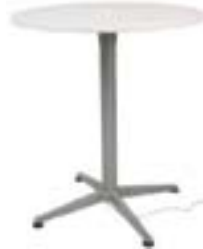
BT408 POWER BAR TABLE White 36"Dia.x42"H