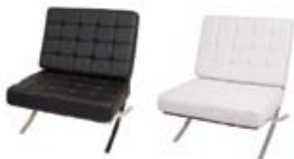
LG717 IBIZA CHAIR Black, White 30"Wx33"Dx33"H