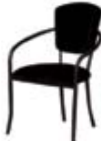
CH102 MONACO CHAIR Black 23"Wx23"Dx18"H