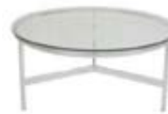
OT860 FIJI COCKTAIL TABLE Chrome/Glass 36"Dia.x17"H