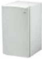
XT900 REFRIGERATOR 4.1 CF Black, White 19"Wx18"Dx32"H