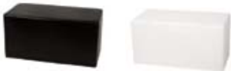
LG757 RECTANGLE OTTOMAN Black, Silver, White Leatherette 36"Wx18"Dx18"H