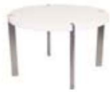
CF602 GLACIER CONFERENCE TABLE White-Gloss 47"Dia.x30"H