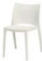
CH113 LESLIE CHAIR White 19"Wx21"Dx18"H