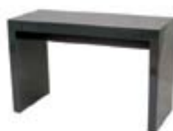
OF670 PARSON DESK Grey, White 48"Wx24"Dx29"H