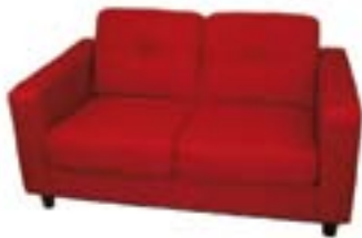
LG713 SOLO LOVESEAT Black, Red 57"Wx35"Dx33"H