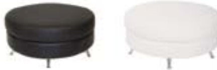
LG760 CAPRI OTTOMAN Black, White 40" Dia.x18"H