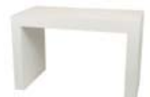
OF671 BALI DESK Black, White 48"Wx24"Dx31"H