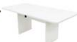
CF605 RECTANGULAR CONFERENCE TABLE Black, Cognac, Maple, White 72"Wx36"Dx30"H