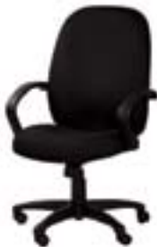
CO508 MIDBACK CHAIR Black 25"Wx24"Dx18-22"H