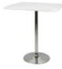
BT404 / BT405 SQUARE BAR TABLE Black, White 30"Sq.x42"H or 36"Sq.x42"H