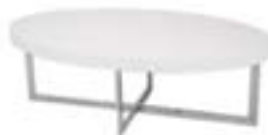
OT814 PALMA COCKTAIL TABLE Walnut, White 47"Wx24"Dx16"H