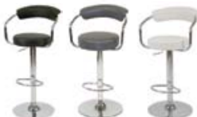
ST218 EURO STOOL Black, Grey, White - Adjustable 20"Wx17"Dx24-33"H