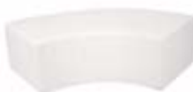
LG731 SOHO CURVED BENCH White 52"Wx22"Dx17"H