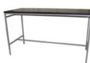
BT457 EDGE COMMUNAL BAR TABLE Black, White 72"Wx30"Dx42"H