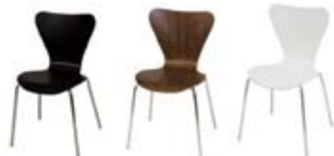
CH114 TENDY CHAIR Black, Walnut, White 17"Wx18"Dx18"H