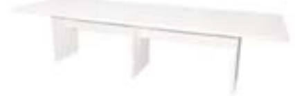
CF611 RECTANGULAR CONFERENCE TABLE Black, White 120"Wx42"Dx30"H

Additional conference table sizes, colors and power options available. Contact your sales rep for information.