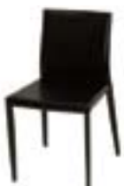
CH115 SHEN CHAIR Black, White 18"Wx20"Dx18"H