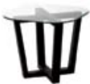
OT802 MONZA END TABLE Black 25"Wx25"Dx21"H