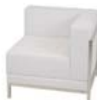
LG744-R MAUI CORNER White 28"Wx28"Dx27"H