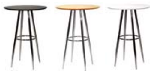
BT407 BRAVO BAR TABLE Black, Natural, White 30"Dia.x42"H