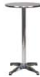
BT410 CHROMA BAR TABLE Aluminum 23"Dia.x42"H