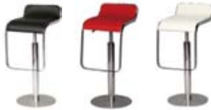
ST203 EQUINO STOOL Black, Red, White - Adj. 14"Wx17"Dx26-30"H