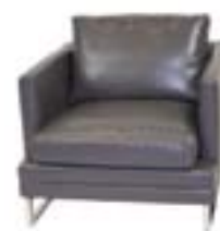
LG735 TRIBECA LEATHER CHAIR Grey 34"Wx36"Dx33"H