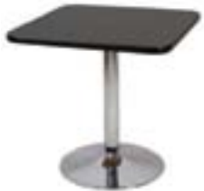
CT304 SQUARE CAFE TABLE Black, White 30"Sq.x30"H