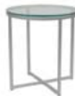
OT844 SPA END TABLE Silver/Glass 24"Dia.x24"H