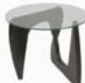
OT859 KAI END TABLE Black/Glass 26"Dia.x22"H