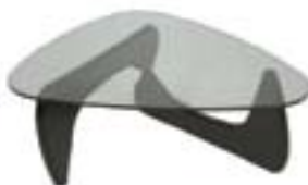
OT858 KAI COCKTAIL TABLE Black/Glass 36"Wx40"Dx15"H