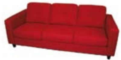
LG712 SOLO SOFA Black, Red 80"Wx35"Dx32"H