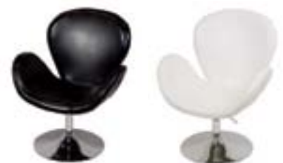
LG786 SWAN CHAIR Black, White 29"Wx28"Dx35"H