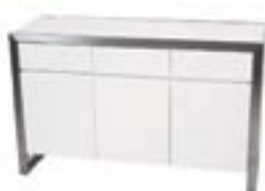
OF660 GLACIER SIDEBBOARD White-Gloss 48"Wx18"Dx30"H