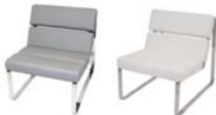
LG729 MIAMI CHAIR Grey, White 27"Wx31"Dx30"H