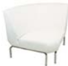
LG711 PRATO CORNER SECTIONAL Black, White 32"Wx32"Dx33"H