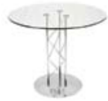
CT306 TRAVE TABLE Chrome/Glass 36"Dia.x30"H (Other sizes available)