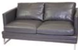
LG734 TRIBECA LEATHER LOVESEAT Grey 61"Wx36"Dx33"H