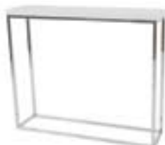
OT857 KLUB SOFA TABLE White 36"Wx10"Dx30"H