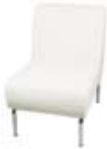
LG710 PRATO ARMLESS SECTIONAL Black, White 22"Wx28"Dx33"H