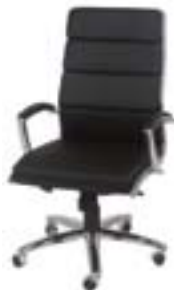
CO520 ZURICH HIGHBACK CHAIR Black, White 26"Wx21"Dx18-22"H