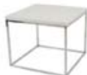
OT856 KLUB END TBL. White 24"Wx24"Dx18"H