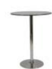
BT413 MARTINI BAR TABLE Chrome/Glass 32"Dia.x42"H