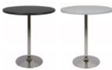
BT402 BAR HIGH TABLE Black, Grey, White 36"Dia.x42"H