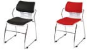
CH103 CAZMA CHAIR Black, Red 22"Wx22"Dx18"H