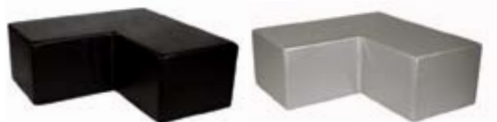
LG756 ANGLE OTTOMAN Black, Silver, White Leatherette 48"Wx48"Dx18"H