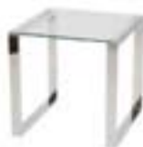
OT818 KEMI END TABLE Chrome/Glass 22"Wx22"Dx22"H